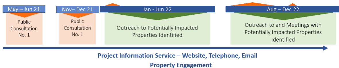
Figure 1 DART+ SW: Summary of Property and Public Engagement

This report summarises the additional consultation and engagement measures carried out for DART+ South West during 2022 while the project design was being further developed and the Railway Order application was being prepared.